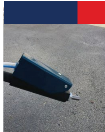
Inbuilt deadman System with Small Dia nozzle helps to make absolute control for the blaster.